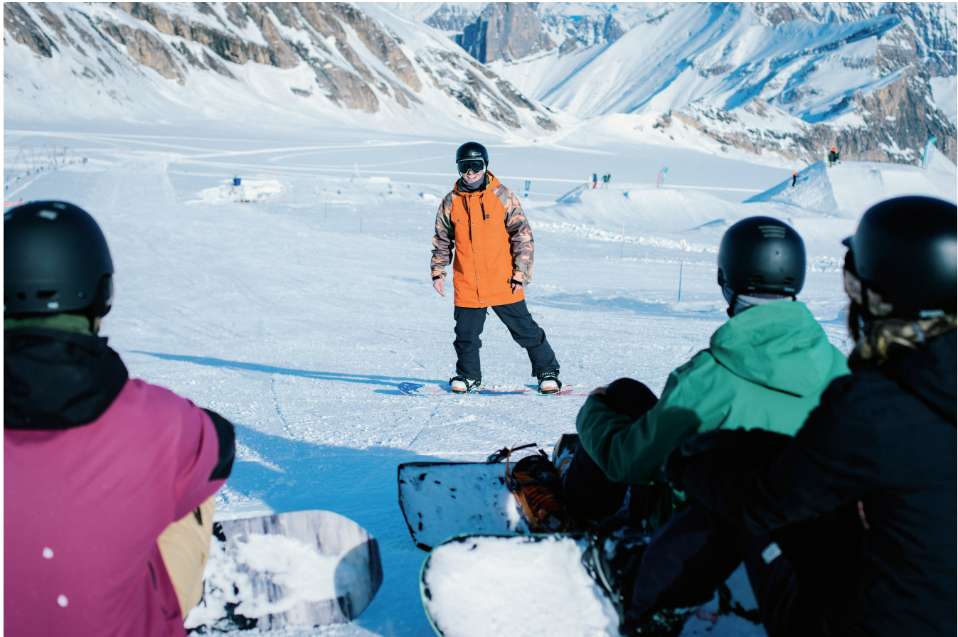
LESSONS FOR ALL AGES AND ABILITIES CAN BE FOUND ANYWHERE IN PORTES DU SOLEIL