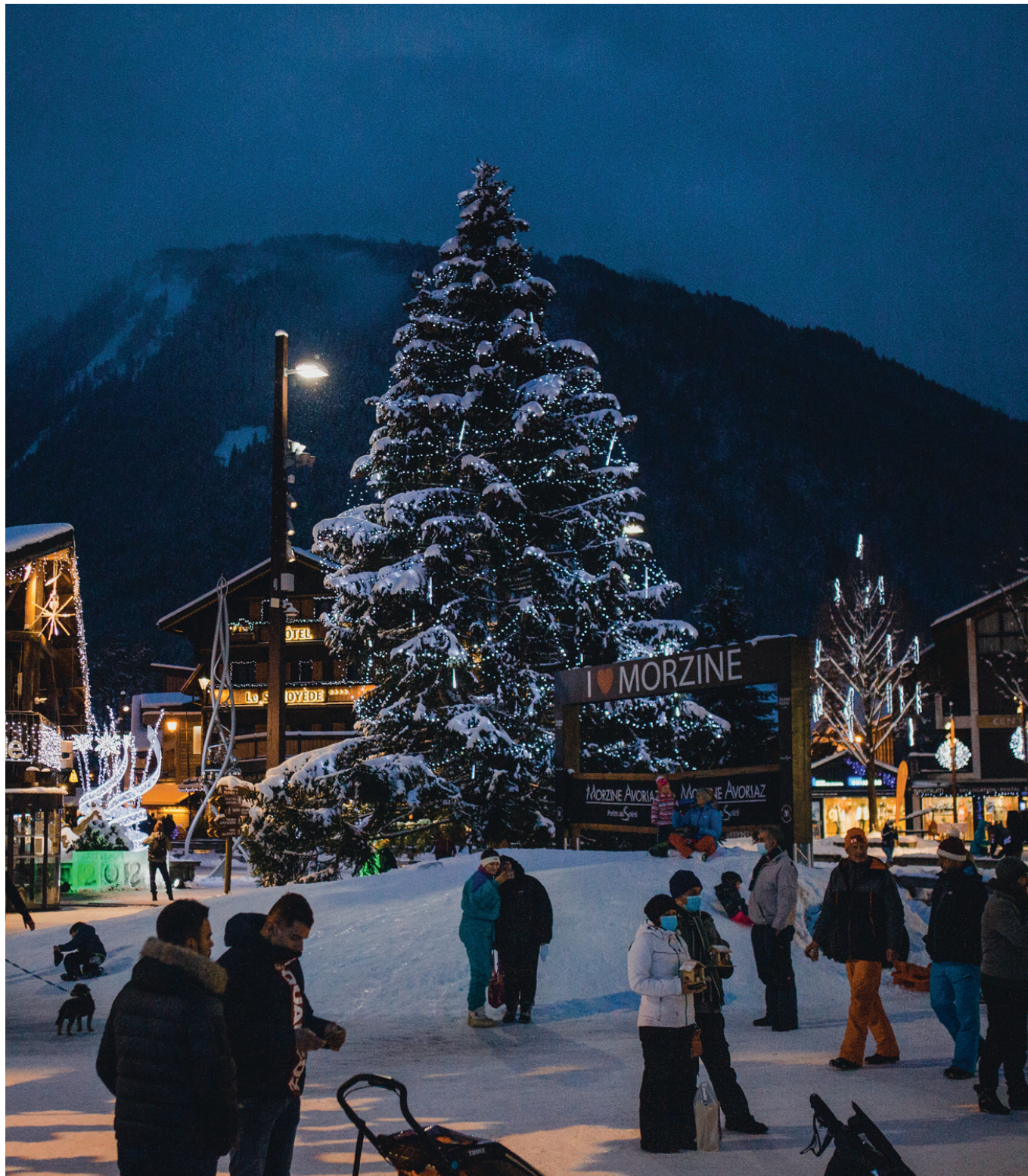
MORZINE, LA STATION DE SKI EN HAUTE SAVOIE